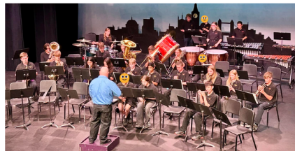
7th Grade Final Band Concert