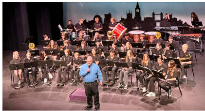
6th Grade Final Band Concert