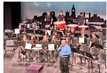
8th Grade Final Band Concert